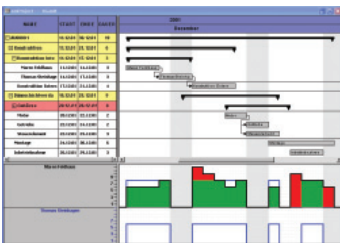
Fig. 1: Project plan as Gantt diagram with resources utilisation